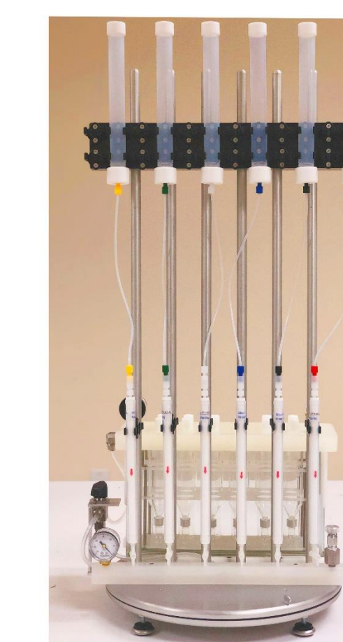
EZPrep123 for TPH

The FMS EZPrep TPH semi-automated system with FMS certified 6 gm silica gel columns gives excellent and fast separation of aliphatic and aromatic hydrocarbons. Six samples can be processed with one EZPrep 123 set-up in 20 min. Excellent recoveries are seen for all analytes (Figures 1 and 2). The combination of the FMS EZPrep TPH system and FMS Teflon silica columns demonstrates consistent and reproducible data with a reliable high throughput.