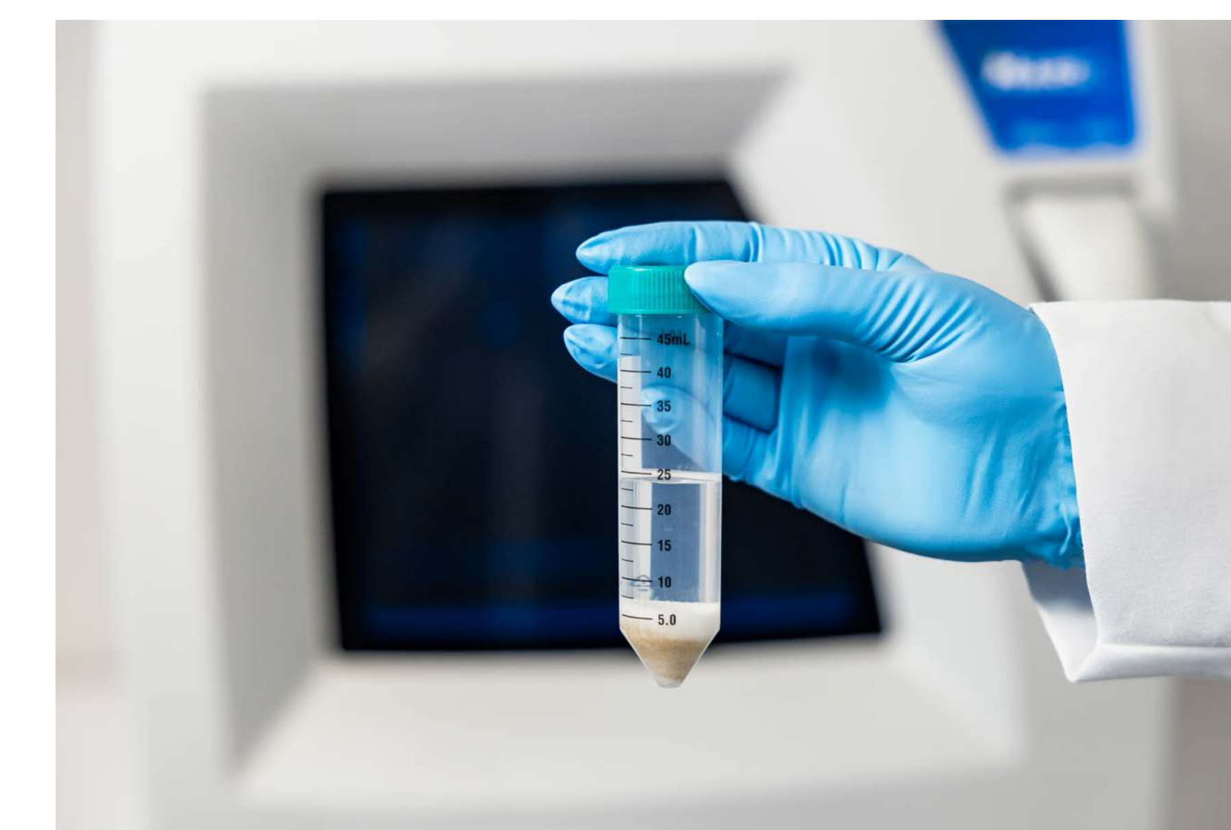
Figure 4. Extracted Soil CRM