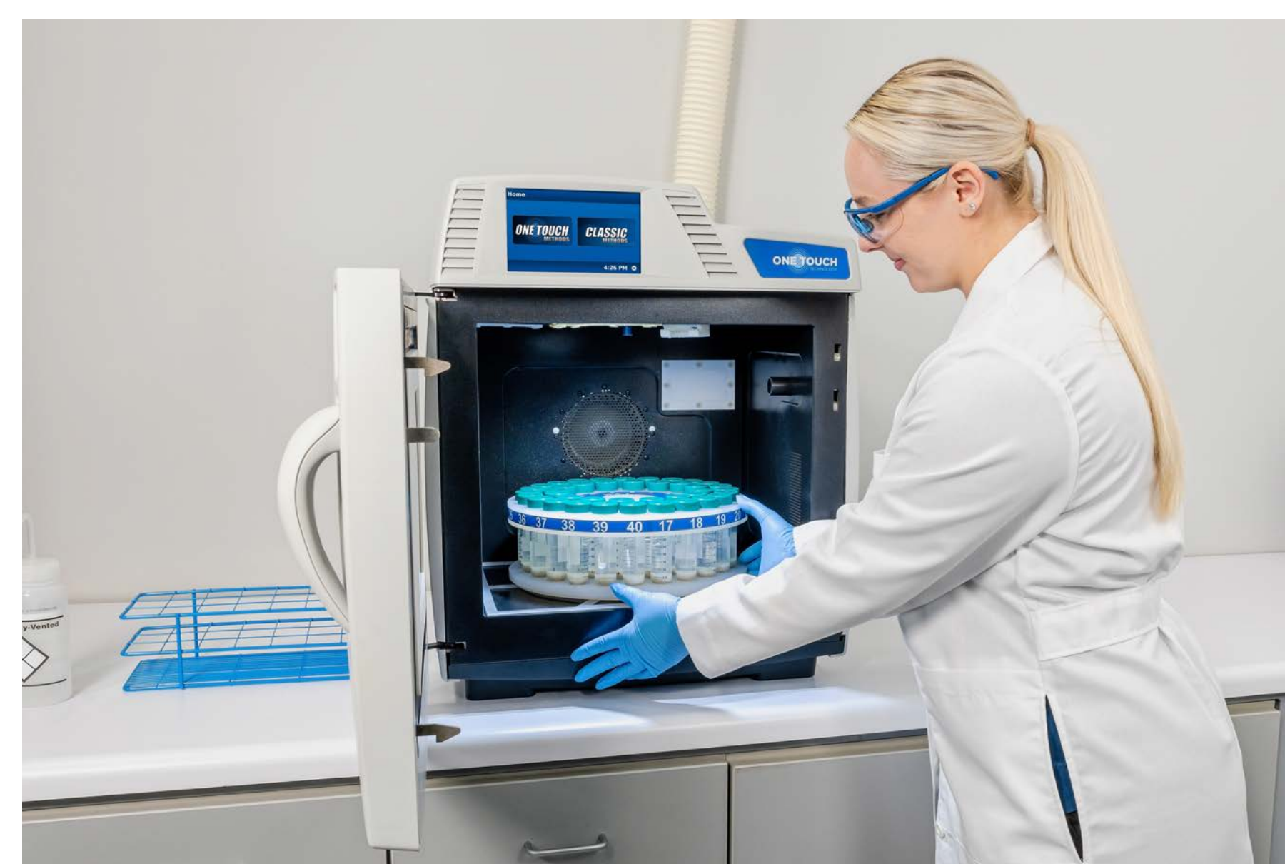
Figure 1. MARS 6 with 40-place Centrifuge Tube Turntable