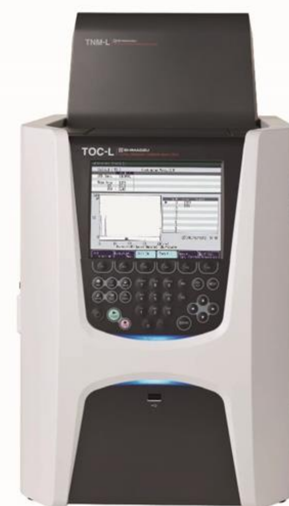
Figure 1: Shimadzu TOC-L with TN Module

This new method (3) couples the Shimadzu TOC-L (Figure 1) High Temperature Catalytic Oxidation (or Combustion) Total Organic Carbon (TOC) analyzer with the Shimadzu TNM chemiluminescent nitrogen detector. The combustion temperature is 720 °C.